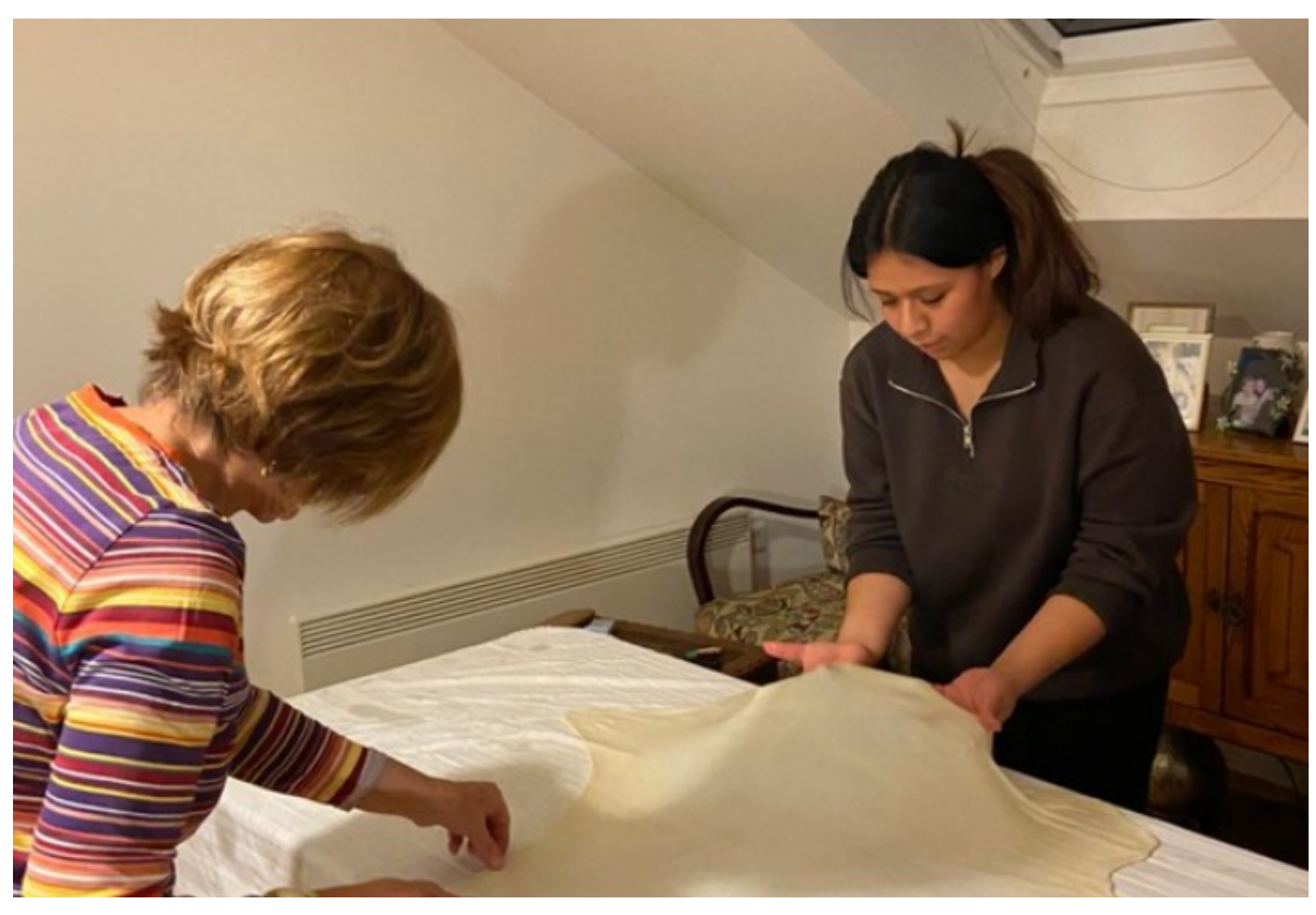
American Councils for International Education Bosnia - November 2023 Monthly Newsletter